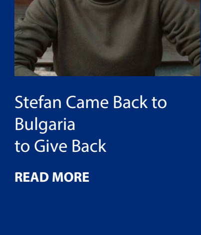
Where Bulgarian and American