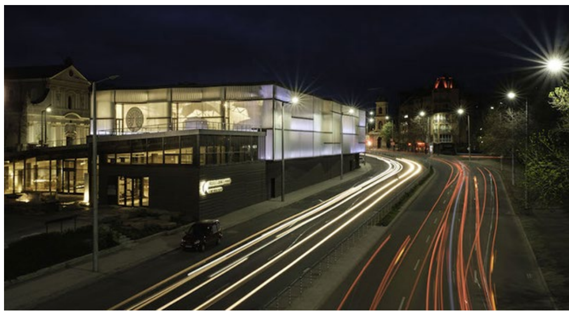
The restored Bishop's Basilica of Philippopolis is welcoming visitors again

No less impressive were the joint efforts of the dozens of organizations and countless individuals who enabled the return to life of the Bishop's Basilica of Philippopolis , a symbol of continuity and transcultural understanding.