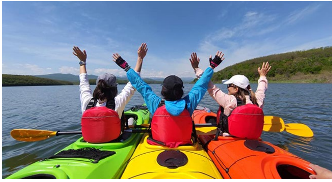
The Danube is an explorer's heaven: the more you discover, the more there is to explore.

Our newest portfolio, tourism, had a strong year. Dozens of initiatives were launched , with many local businesses and hundreds of individuals benefiting from them.