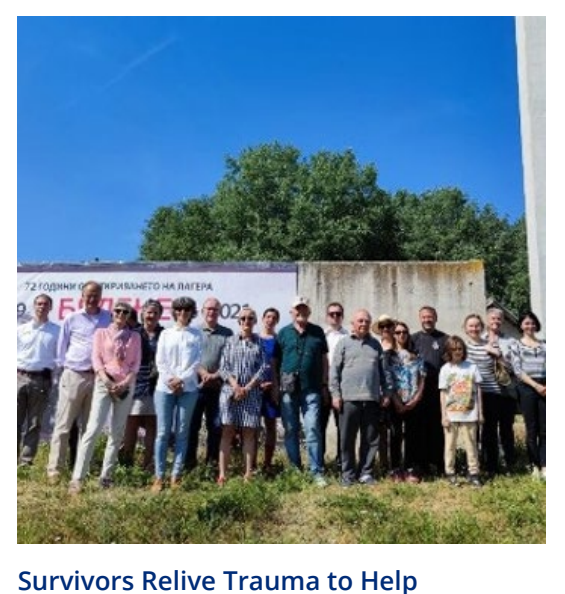
Contemporaries Avoid Past Mistakes

Every year we visit Belene to honor the victims of Bulgaria's former totalitarian regime and to reflect on the gains brought about by democracy.