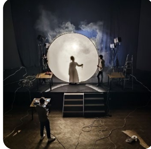
With Atelier 3, Architecture Enables Both Space and Time Travel

Conventionally, architects situate their work within three-dimensional space. Architectural studio Atelier 3, however, works beyond convention.