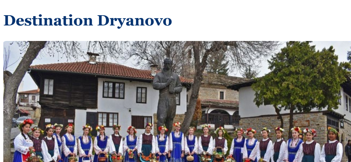
A Town That Preserves the Fervent, Nonconformist Spirit of Its Ancestors

Dryanovo is better known for its architecture, caves, and prehistoric finds, but the town's most valuable resource is its people: quirky, tough, capable, hardworking.