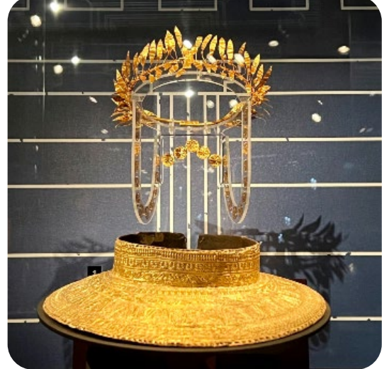
An Exhibit about the Ancient Past May Promote Accord Today

By showcasing the achievements of the Balkans' earliest societies, the First Kings of Europe exhibition emphasizes the region's shared heritage.