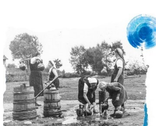
Stella Goes in Search of Sunken Villages, Forgotten Stories