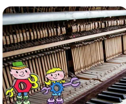
Cartoon Characters Poly and Techno Aid in STEM Learning